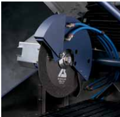
Wheel guard pivots open for easy wheel changing.