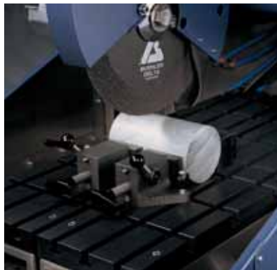
10-3529 and 10-3530 Sliding vises secure samples up to 5" (127mm).