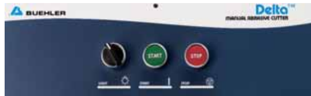
Easy-to-use control panel.

The fiberglass hood's wide opening provides easy access to the large cutting bay for sample positioning and retrieval. A generous cutting table area provides ample space for large and irregular parts. Side access ports allow over sized parts to be positioned. Equipped with two T-slot vise beds with x and y cross-slots, ideal for handling a variety of component shapes and sizes. Can accommodate an additional two vise beds. The standard 14mm DIN slots accommodate a wide selection of vises (sold separately) to suit a variety of applications. The Delta cutter has a 33" (838mm) width, and can easily fit through most doorways for easy installation.