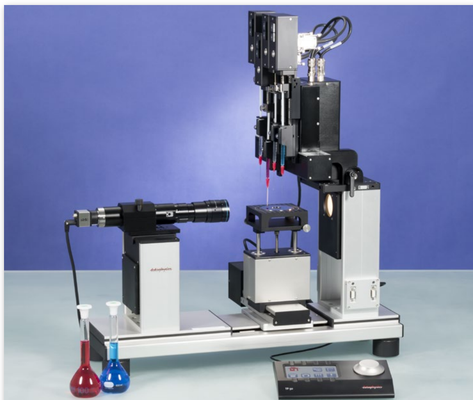
Fig. 2: DataPhysics Instruments optical contact angle measuring and contour analysis system OCA 200

For surface energy determination the three test liquids diiodomethane, ethylene glycol and 2,2-thiodiethanol have been chosen for dosing drops with a volume of 1 \mu\text{L} on the polymer surfaces and the respective contact angles were measured.