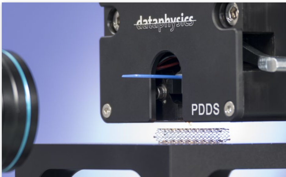
Fig. 1: picolitre dosing system PDDS

The surface energies of a tinned and a pure copper wire have been determined measuring contact angles with various liquids using the optical contact angle measuring and contour analysis system OCA 200 in combination with the picolitre dosing system PDDS. With this system it is possible to determine the surface energy directly on the thin wires, which are just a few 100 \mu\text{m} in diameter, since optimizing the shape and minimizing the volume of the picolitre drops allows to reliably measure contact angles even on smallest surfaces.