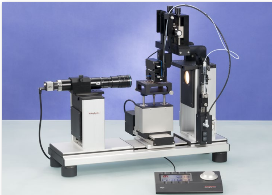
Fig. 2: DataPhysics Instruments optical contact angle measuring and contour analysis system OCA

Thus, in the application note at hand we demonstrate how to proceed to generate optimal, reliable drops with the PDDS as we present the determination of the surface energy of two copper wires.