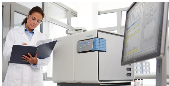
Figure 1. FlashSmart Elemental Analyzer.

The Thermo Scientific™ EagerSmart™ Data Handling Software generates a complete report, displayed at the end of the analysis. The EagerSmart Data Handling Software features the option AGO (Argon Gas Option), which allows the user to manage the flow of argon gas during the run.